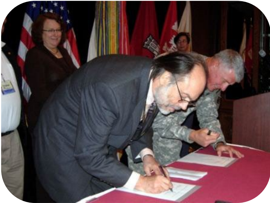
Corps Foundation MOU signing